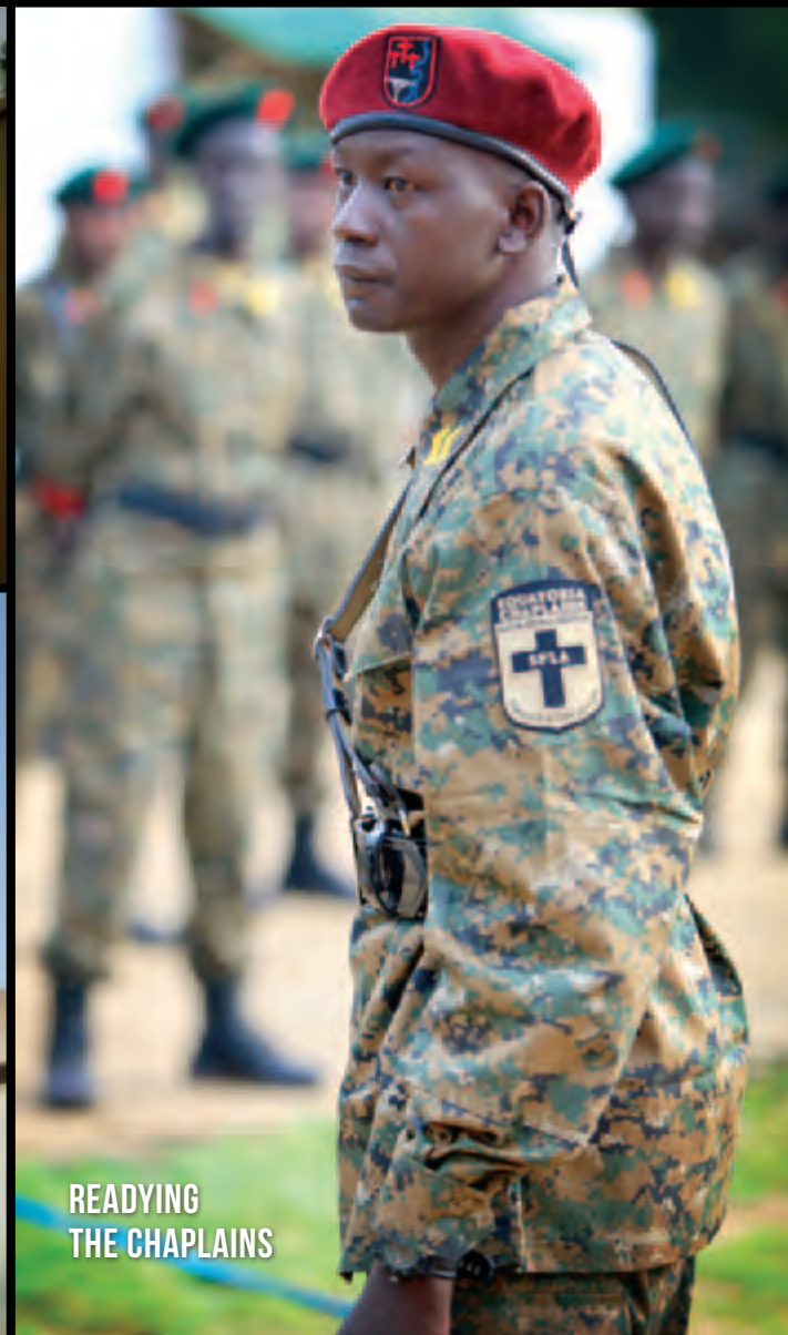
READYING THE CHAPLAINS