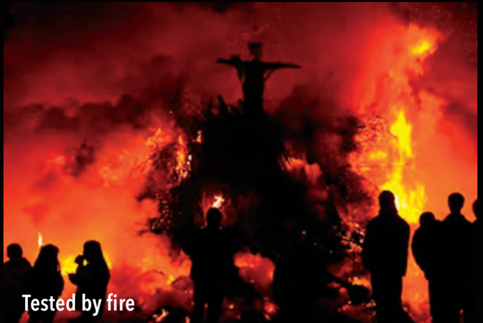
Tested by fire

The military officer drove us to a military base and let us out of his car. To avoid being shot, we immediately called the military and gave them our location. The base commander asked my friend, "How many people are with you?" He replied, "We are four." The commander readjusted the scope he was looking through and said, "From here, I see your whole number is five." My friend, confused, recounted us before saying, "Sir, we are four. We are not five." Again, the commander insisted, "I see a fifth man standing at your side." We were in awe as we realized that the fifth person in our group was Jesus! Jesus had come as a military officer to deliver us from the enemy. Not only did He deliver us, but we knew He was still with us, watching over us. Though unseen to our eyes, He was seen by the base commander. I now truly understand what it means when Jesus says, "I will never leave you nor forsake you." It was He who