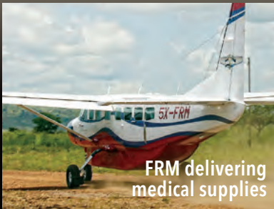
FRM delivering medical supplies

In the last year alone, Far Reaching Ministries (FRM) has flown eight metric tons of medical supplies into the