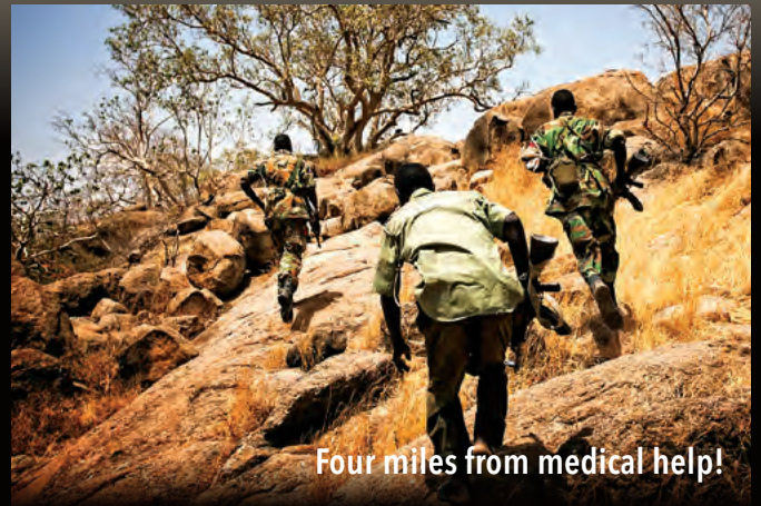
Four miles from medical help!

chaplains' base because they have played such a critical role in their fight for freedom.