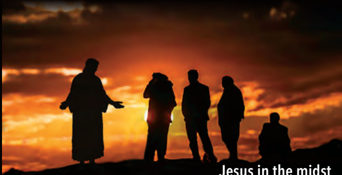
Jesus in the midst

سلام لَكُمْ باسم الرب يسوع المسيح (Peace to you in the name of our Lord Jesus Christ.)