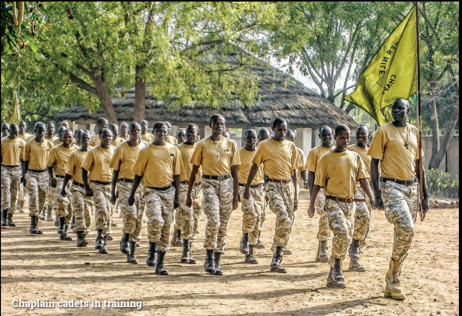
Chaplain cadets in training

“For God so love the world that He gave His only begotten Son, that whoever believes in Him should not perish but have everlasting life.” - John 3:16