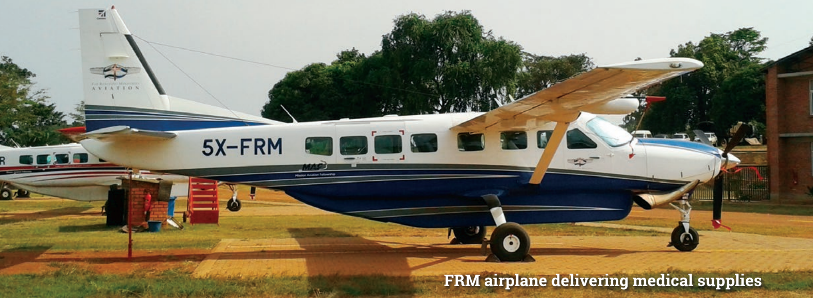
FRM airplane delivering medical supplies

efforts in feeding the elderly, including several letters of thanks that have come from cities we've worked in. When we are about the Father's business all the glory goes to Him!