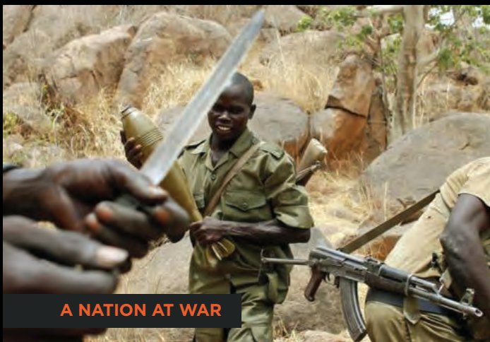
A NATION AT WAR