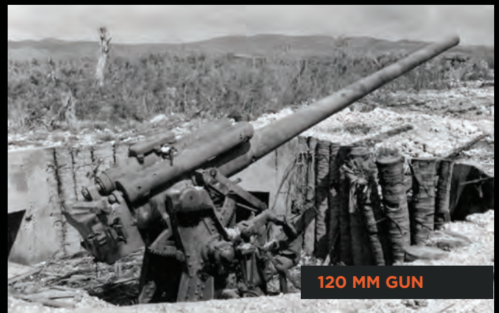
120 MM GUN

In the Old Testament, we have 613 commands and 1,050 in