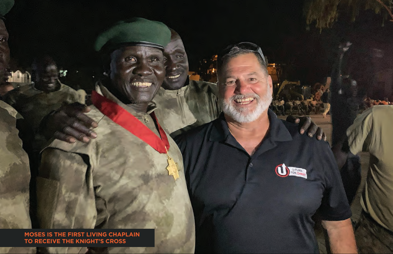
MOSES IS THE FIRST LIVING CHAPLAIN TO RECEIVE THE KNIGHT'S CROSS

The trauma that was being inflicted on the local populace was having a terrible effect. People could not live without fear, and many began to flee the only homes they had ever known.