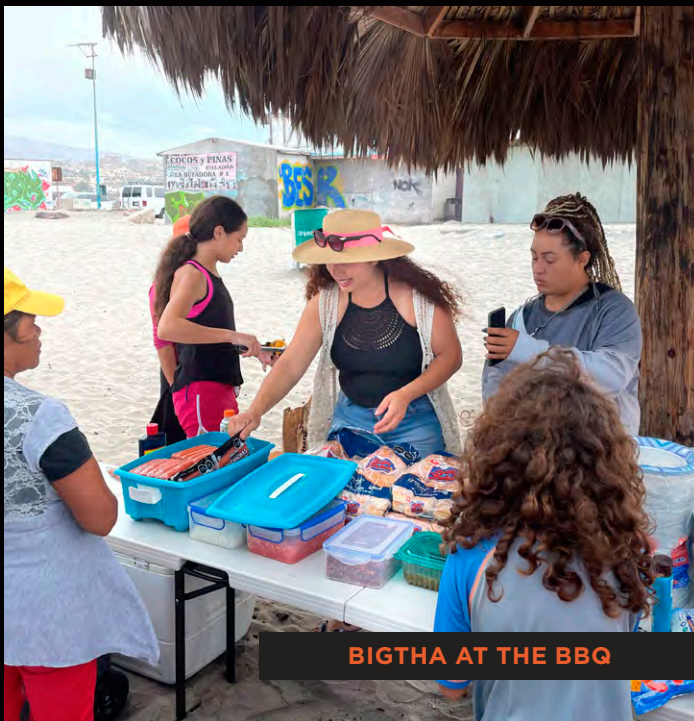
BIGTHA AT THE BBQ