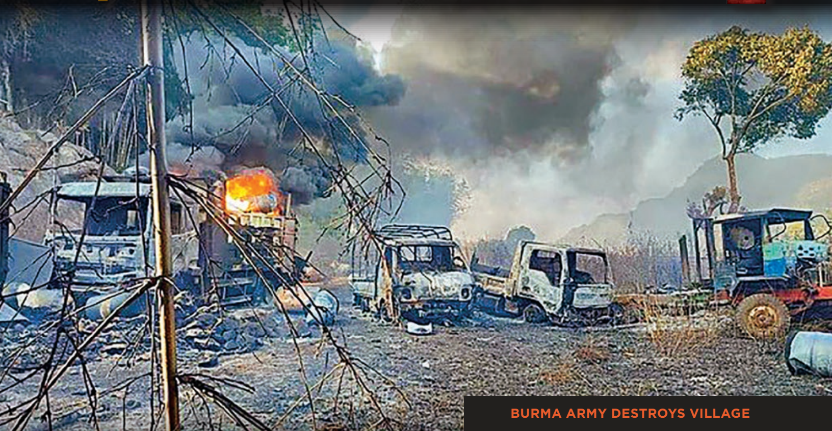
BURMA ARMY DESTROYS VILLAGE