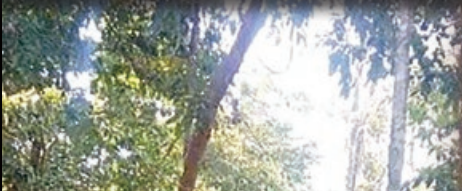
HIDING FROM BOMBS