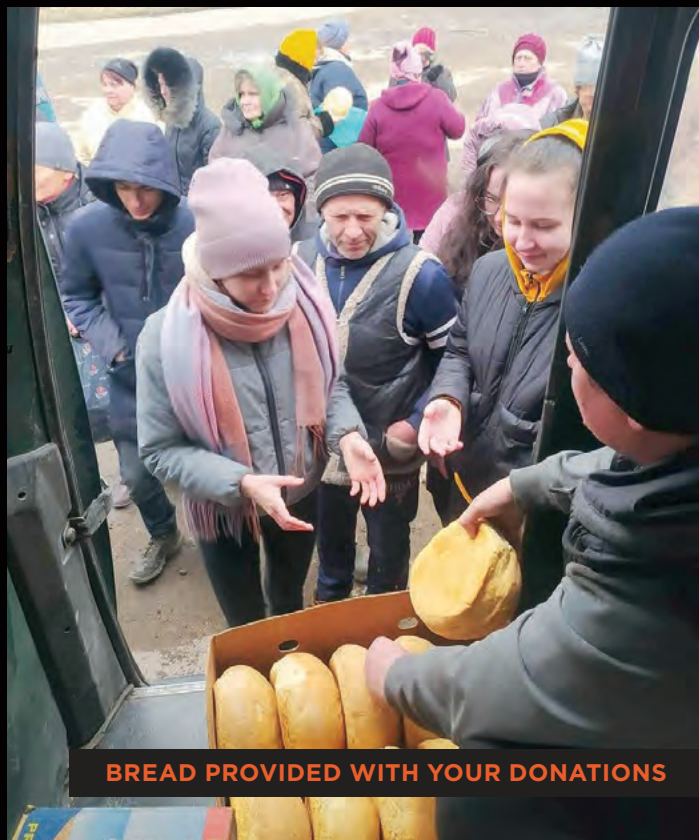
BREAD PROVIDED WITH YOUR DONATIONS