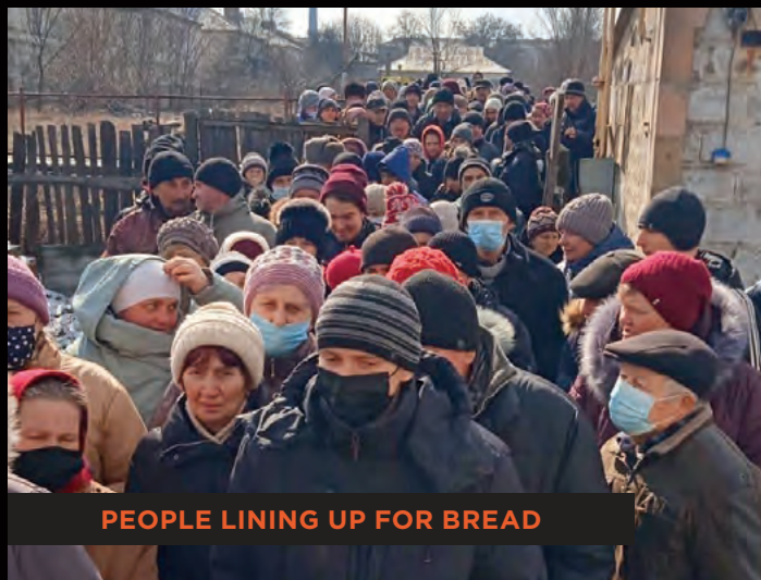
PEOPLE LINING UP FOR BREAD