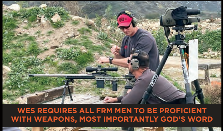
WES REQUIRES ALL FRM MEN TO BE PROFICIENT WITH WEAPONS, MOST IMPORTANTLY GOD'S WORD

In addition to our rescue operation in Afghanistan we