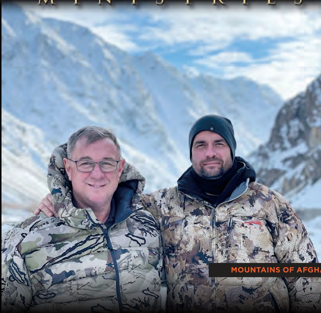
MOUNTAINS OF AFGHANISTAN

On the 4th of March, we had three aircraft scheduled to fly 910 Afghans out of Afghanistan. Unfortunately, when Russia invaded Ukraine, the flights were canceled. Our intelligence found out that Afghanistan had an agreement that no planes could leave Afghanistan air space and fly to an EU (European Union) or NATO (North Atlantic Treaty Organization) country. This presented a tremendous problem for us. We had over 500 individuals in safe locations protected by Far Reaching Ministries (FRM) and another 400 in other safe houses, all hoping that this would be the day of salvation from the Taliban. Months of planning seemed, for a moment, to have been thwarted by the enemy. Again, I cannot go into detail, but we have developed an alternative escape route and have already moved over 200 more people out of Afghanistan since the 4th of March. We are working