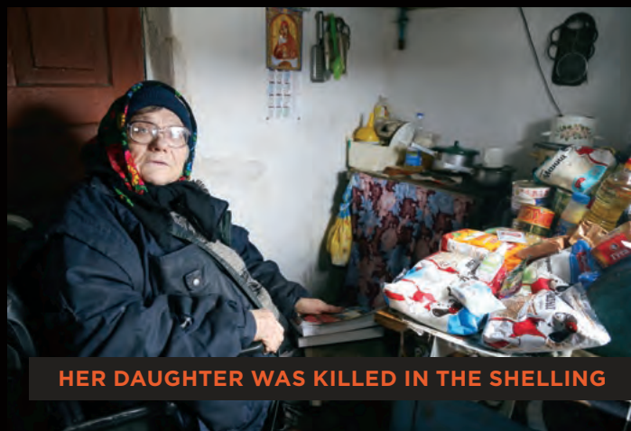
HER DAUGHTER WAS KILLED IN THE SHELLING