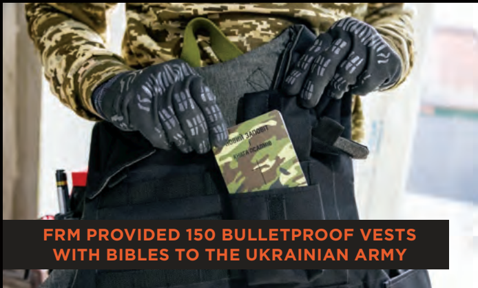
FRM PROVIDED 150 BULLETPROOF VESTS WITH BIBLES TO THE UKRAINIAN ARMY

time someone approached, the sniper killed them. In the dream, I told everyone not to worry that I would deal with him. I entered the structure with another sniper that I had been working with. I told him that I would take the lead as we cleared the building floor by floor. The other man working with me watched our back in case somehow we missed the sniper. As I rounded a corner, I saw plastic and carpet on the floor that was moving. Knowing this