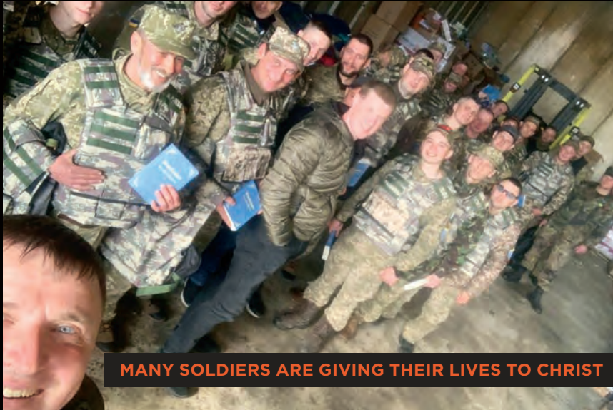
MANY SOLDIERS ARE GIVING THEIR LIVES TO CHRIST

Now it is very possible that the Lord will bring others along who want to be a part of the Bible school and donate to store treasures in heaven. I am praying God