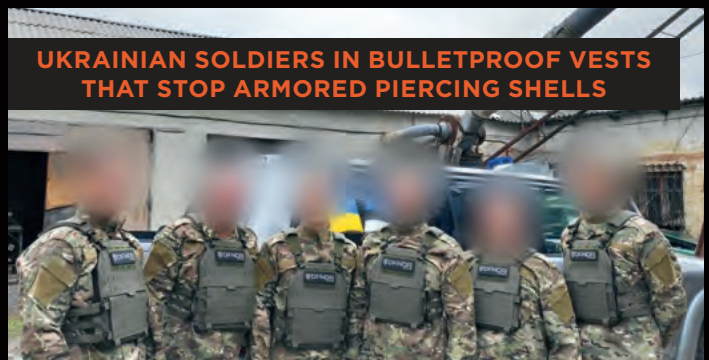
UKRAINIAN SOLDIERS IN BULLETPROOF VESTS THAT STOP ARMORED PIERCING SHELLS