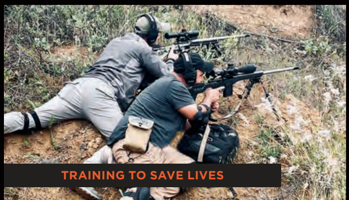
TRAINING TO SAVE LIVES

While staying in Amsterdam, I want to share that I had a dream on the 6th of April. This was one of the most vivid dreams I have ever had. In the dream, I was looking for a Calvary Chapel pastor who had gone missing in Ukraine. I was in a city and told that there was a sniper killing many civilians. I explained that I had shot battalion and division matches in the Marine Corp and was a "crack shot." I agreed to take out the sniper. In the dream, I successfully completed the task, and I became known for being called on when snipers were killing civilians.