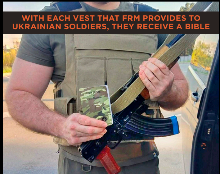
WITH EACH VEST THAT FRM PROVIDES TO UKRAINIAN SOLDIERS, THEY RECEIVE A BIBLE

grain globally and can meet the needs of displaced people if they can get their products to warehouses for distribution. The head of the chaplain program came up with the idea that for $75/month (vs. $500 for bringing in food from outside), you can support a family of 8 with all the food they need. Better yet, the food is sourced from Ukrainian farmers who haven't been able to get their supply to market due to the war. Once sourced, it is taken to a warehouse, where it is packaged and distributed to families in need.