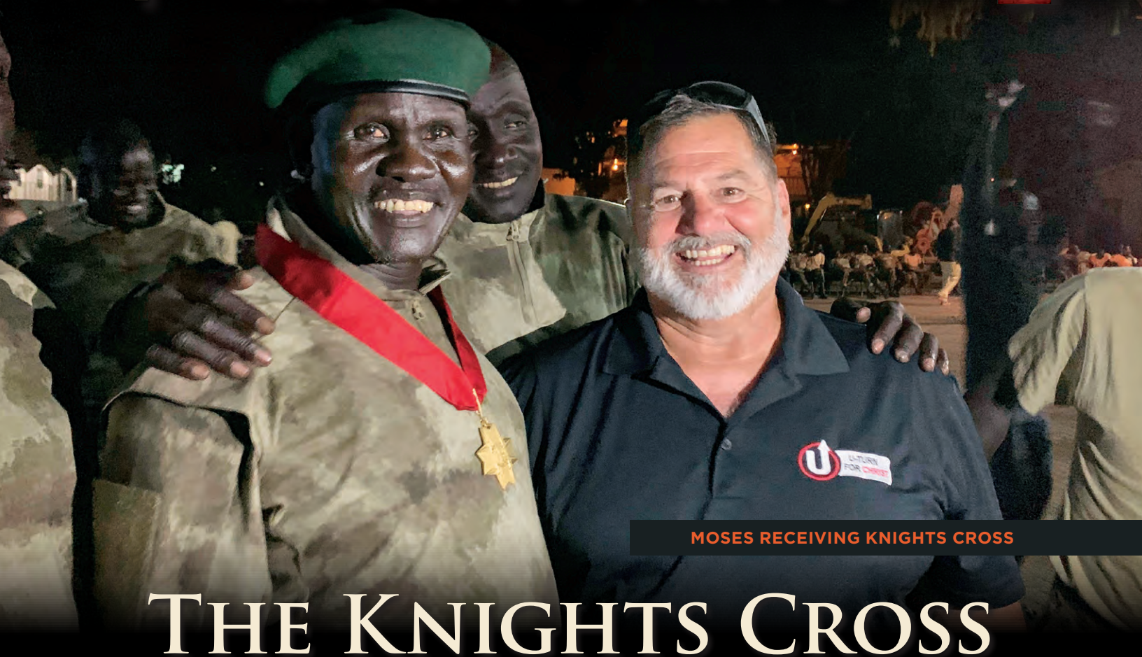
MOSES RECEIVING KNIGHTS CROSS