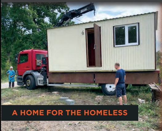
A HOME FOR THE HOMELESS

Ukraine continues to be under siege and needs our prayers and support.