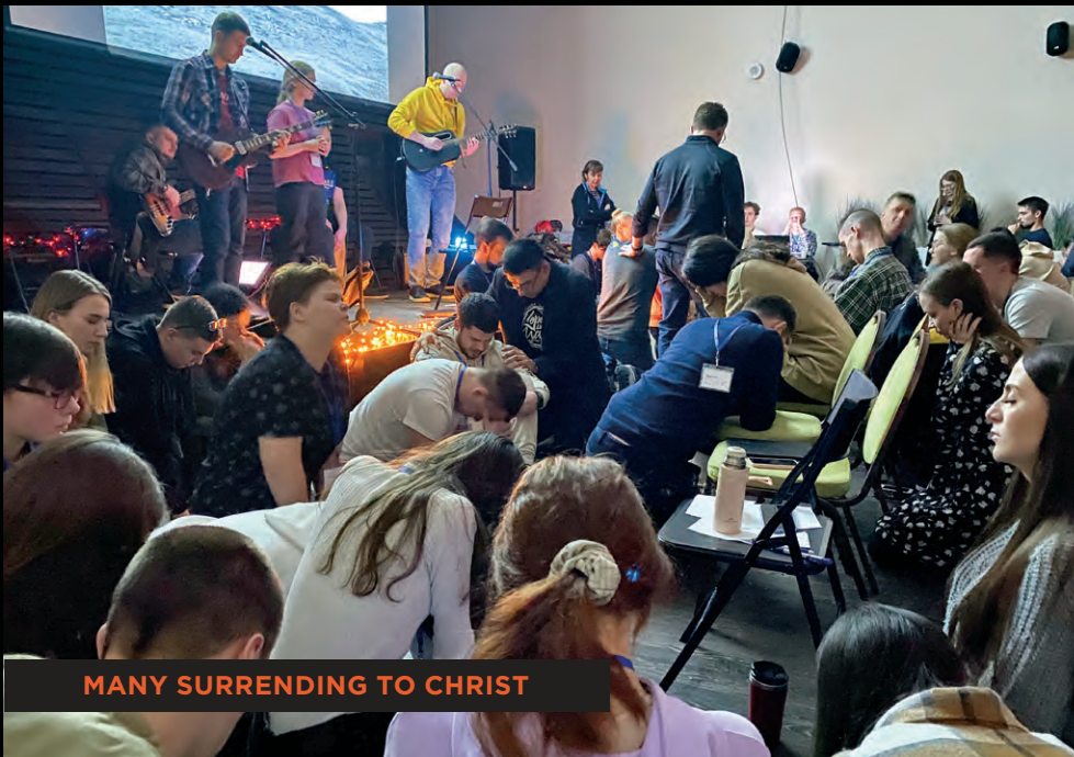
MANY SURRENDERING TO CHRIST