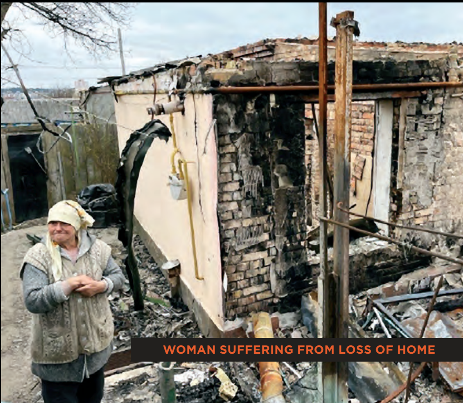
WOMAN SUFFERING FROM LOSS OF HOME

This year, the Potatoes for Grandmothers Christmas outreach will be for the elderly of Ukraine. We can get one elderly person through the winter for $500. We have had to raise the cost because firewood will be needed by many, and cutting, loading, and transporting it to those who will need it most is very difficult.