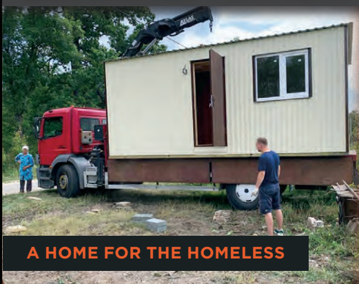
A HOME FOR THE HOMELESS

Ukraine continues to be under siege and needs our prayers and support.