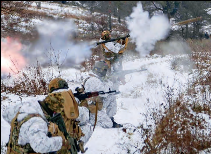
OUR CHAPLAINS ARE AT THE FRONT WITH THE MEN

The young man was too weak to continue, and the President signed the letter written from your son by Abraham Lincoln. The soldier asked to see the letter, and when he read it, he said are you really the president, and Mr. Lincoln responded yes and asked if he could do anything else. The soldier responded, I think it would help if you held my hand and stayed with me through to the end. The President granted his request, offering warm words of encouragement until death took him with the dawn.