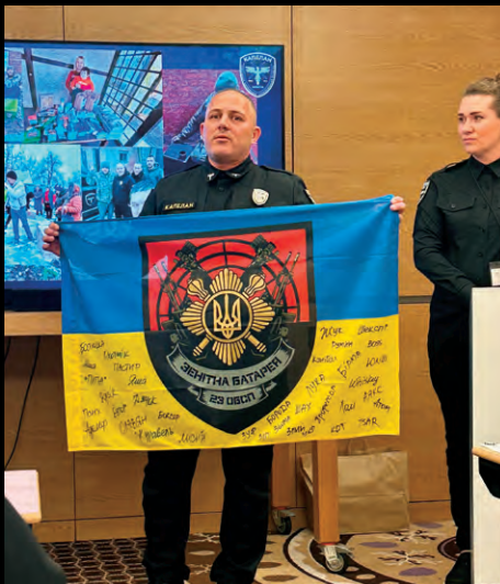
FLAGS SIGNED BY CHAPLAINS GIVEN TO ALL MEMBERS OF OUR TEAM IN APPRECIATION FOR SUPPORTING UKRAINIAN CHAPLAINS

I have always thought that if I reached an age when I was too old to travel, I would enjoy restoring a classic car. I enjoy watching shows that take an old car that is a wreck and bring it back to life. Truthfully, I would enjoy having a garage with half a dozen cars that I could slowly restore. Watching shows that bring a wreck back to a thing of beauty reminds me of how the Lord takes broken lives and restores them. But I would far more desire to save these children and set up places of refuge for the handicapped and children of all ages, including babies and toddlers. Please understand we plan on starting what does not exist in Ukraine, and when we find children who are being abused by parents, we will not allow it to continue. When the laws of the land do not protect women and children, we, as believers, answer to a higher law, God's law, and will do what is necessary to ensure these children are not harmed by parents or anyone, such as a boyfriend.