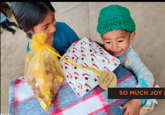
SO MUCH JOY FOR THE PRESENTS