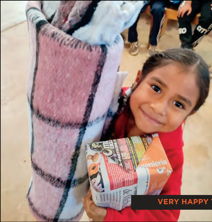
VERY HAPPY TO RECEIVE GIFTS

them, this will be the only gift they receive, but the kids will not be disappointed, instead they will be happy as a child can be.