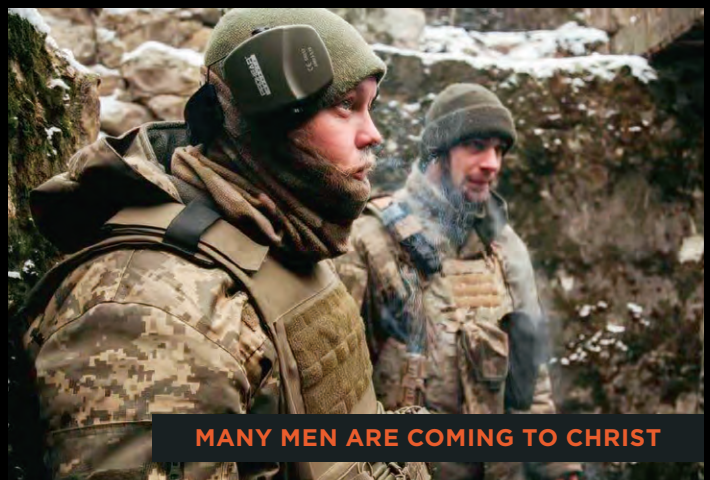
MANY MEN ARE COMING TO CHRIST