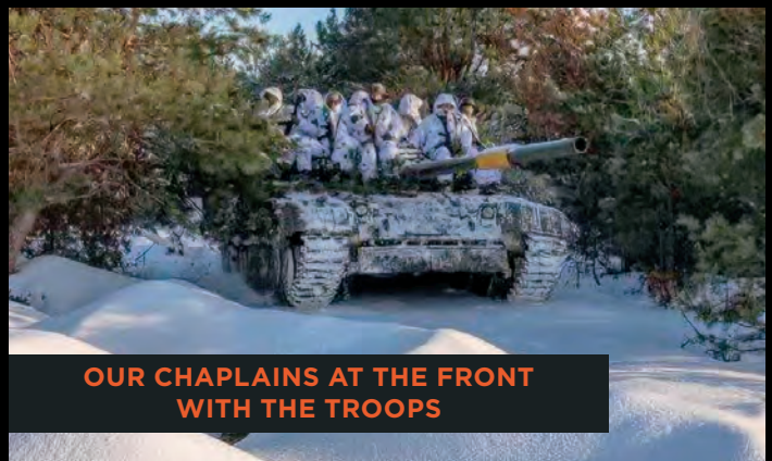
OUR CHAPLAINS AT THE FRONT WITH THE TROOPS

In other news, our chaplains in Ukraine are with the soldiers at the front and leading many to Christ. The winter conditions make fighting very difficult, and they need prayer. I have not kept up with how many lives they have saved, but it is well over 500 and probably closer to 1,000. One of the needs is fuel for vehicles to carry out rescue operations. Currently, $20,000 is needed to purchase about 4,000 gallons of fuel and this will help get them through the winter.