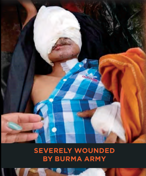
SEVERELY WOUNDED BY BURMA ARMY

Far Reaching Ministries (FRM) has been working with our Ghost Operations team to protect Christian Karenni people in Burma. They have been violently persecuted by the Burmese Army. Many have been killed, their villages have been burnt down, and women have been raped.