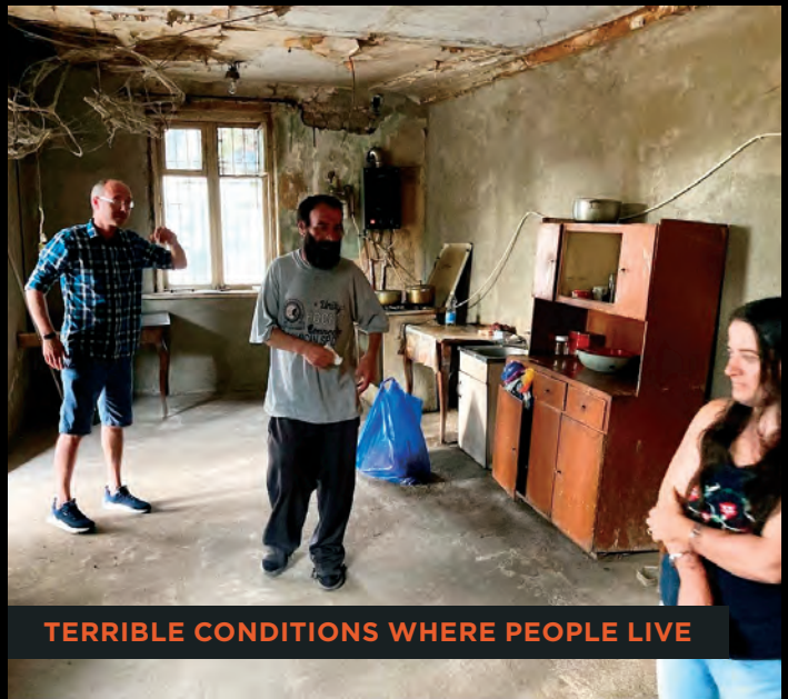
TERRIBLE CONDITIONS WHERE PEOPLE LIVE

But none of these things move me nor do I count my life dear to myself, so that I might finish my race with joy, and the ministry which I received from the Lord Jesus to testify to the gospel of the grace of God.