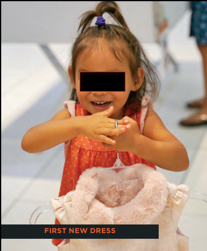
FIRST NEW DRESS