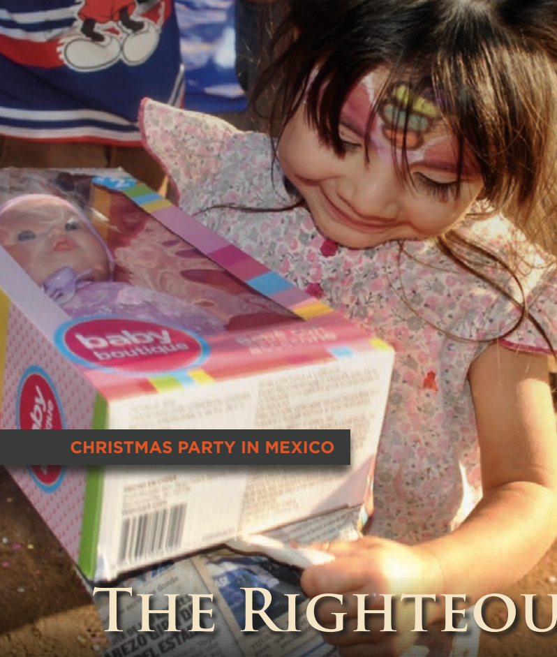
CHRISTMAS PARTY IN MEXICO