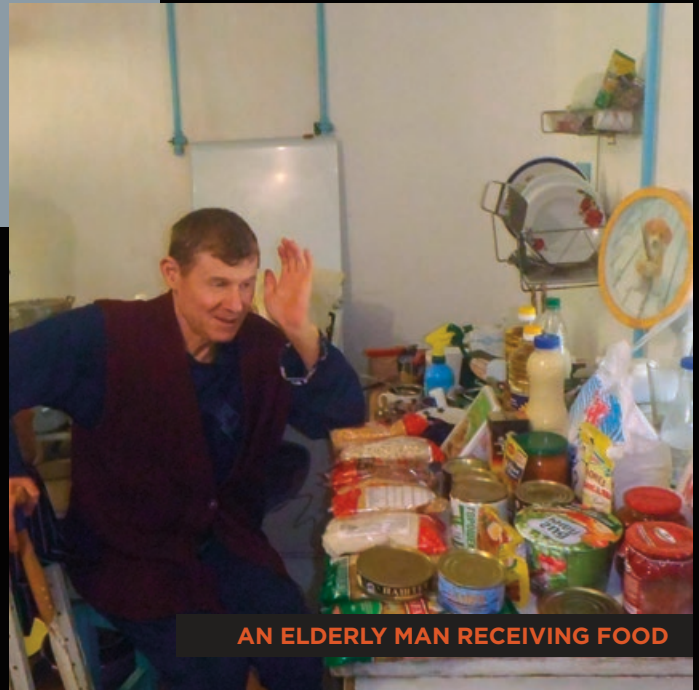
AN ELDERLY MAN RECEIVING FOOD

“Even in darkness light dawns for the upright, for those who are gracious and compassionate and righteous. Good will come to those who are generous and lend freely, who conduct their affairs with justice. Surely the righteous will never be shaken; they will be remembered forever. They will have no fear of bad news; their hearts are steadfast, trusting in the Lord...He has scattered his gifts to the poor.”