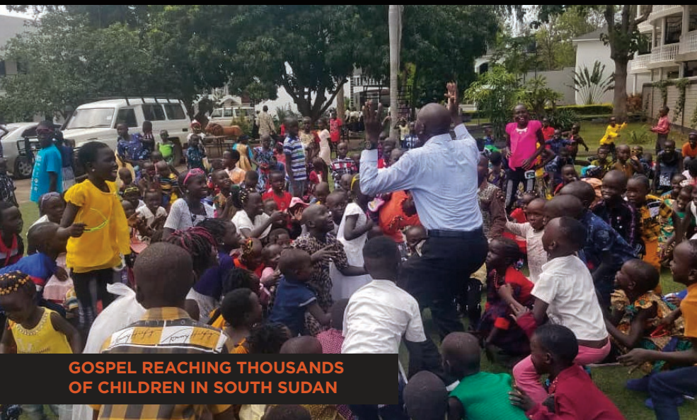
GOSPEL REACHING THOUSANDS OF CHILDREN IN SOUTH SUDAN

The next two years I was so busy with the Lord’s work that it passed quickly. And two months short of two years, I was debt free. How? It was just the Lord’s faithful provision. The Lord kept His promise and had taken care of all my needs. Several years later, I discovered in the back of my cupboard, the boxes of cornbread—I had forgotten about them because the Lord had always sustained me.