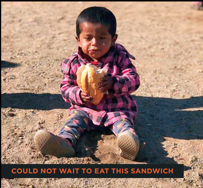
COULD NOT WAIT TO EAT THIS SANDWICH

jump in and all kinds of games. Witnessing how excited the children get is wonderful to watch. Next, we provide lunch with hotdogs covered in jalapenos and onions with mustard and ketchup, which is a real treat for the kids.