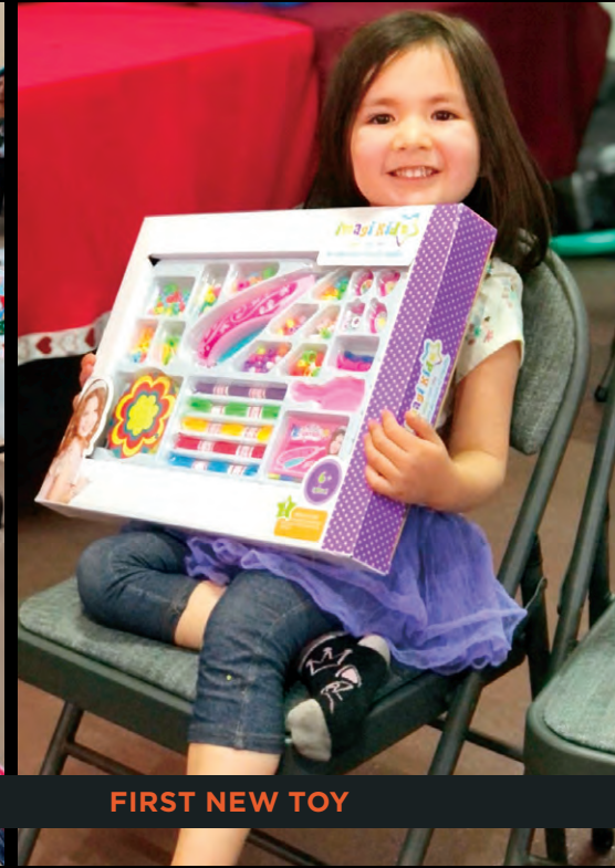
FIRST NEW TOY