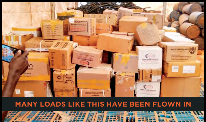
MANY LOADS LIKE THIS HAVE BEEN FLOWN IN