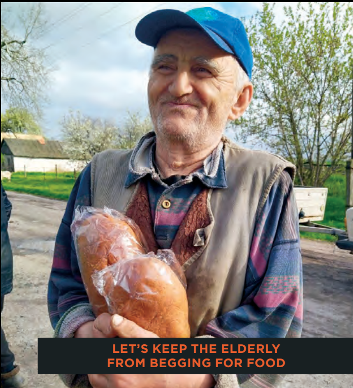
LET'S KEEP THE ELDERLY FROM BEGGING FOR FOOD

children in Ukraine, for $100, we can purchase food, a toy, and new winter boots. For each celebration in Mexico and Central America, the cost to provide Christmas for a child is about $50. For this amount, we are able to provide a Christmas toy and warm blanket along with a Christmas meal. In addition, we are hoping to purchase 700 new winter jackets for children in Ukraine. We want to be ready when there is a child in need and providing them with a jacket in the cold winter months is a blessing. If we purchase them in bulk, they will cost approximately $25,000. We also want to inform you that FRM just delivered an entire plane load of medical supplies to the Nuba