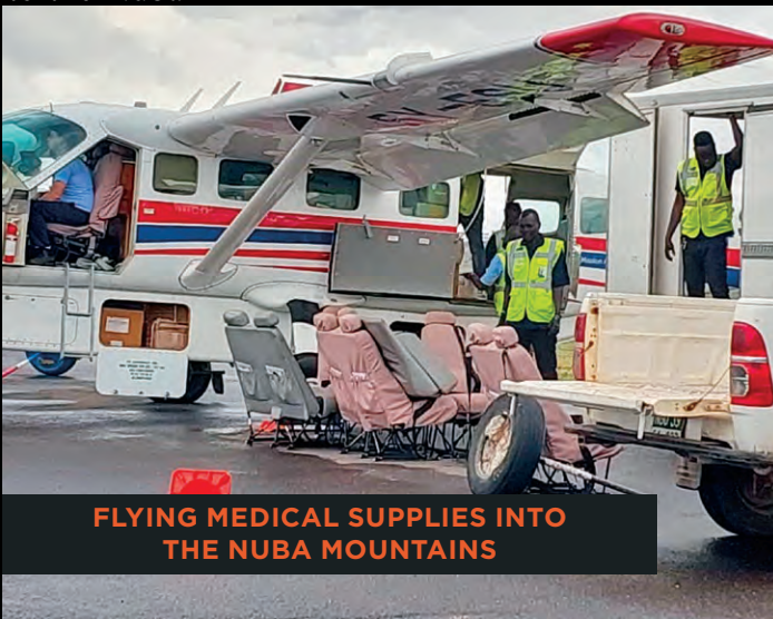
FLYING MEDICAL SUPPLIES INTO THE NUBA MOUNTAINS

children in Ukraine, for $100, we can purchase food, a toy, and new winter boots. For each celebration in Mexico and Central America, the cost to provide Christmas for a child is about $50. For this amount, we are able to provide a Christmas toy and warm blanket along with a Christmas meal. In addition, we are hoping to purchase 700 new winter jackets for children in Ukraine. We want to be ready when there is a child in need and providing them with a jacket in the cold winter months is a blessing. If we purchase them in bulk, they will cost approximately $25,000. We also want to inform you that FRM just delivered an entire plane load of medical supplies to the Nuba