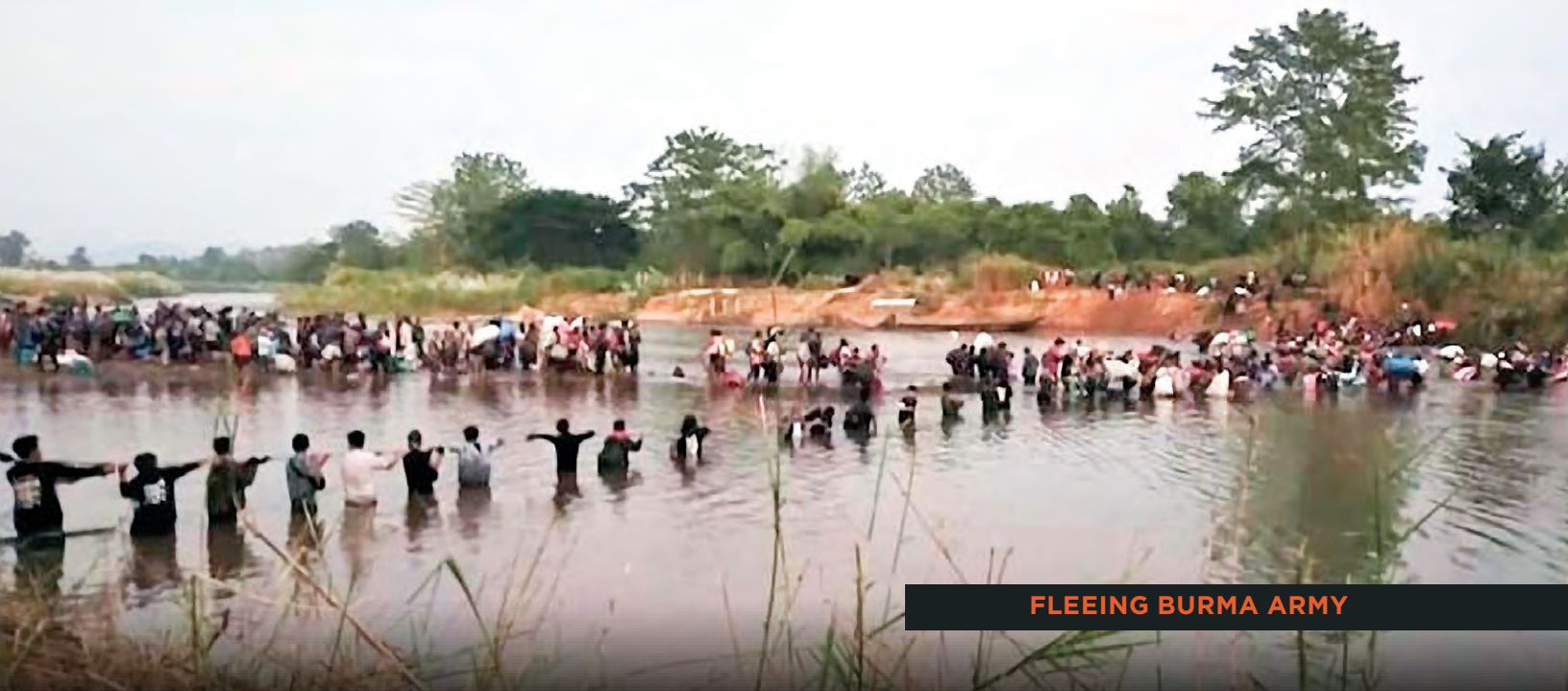
FLEEING BURMA ARMY