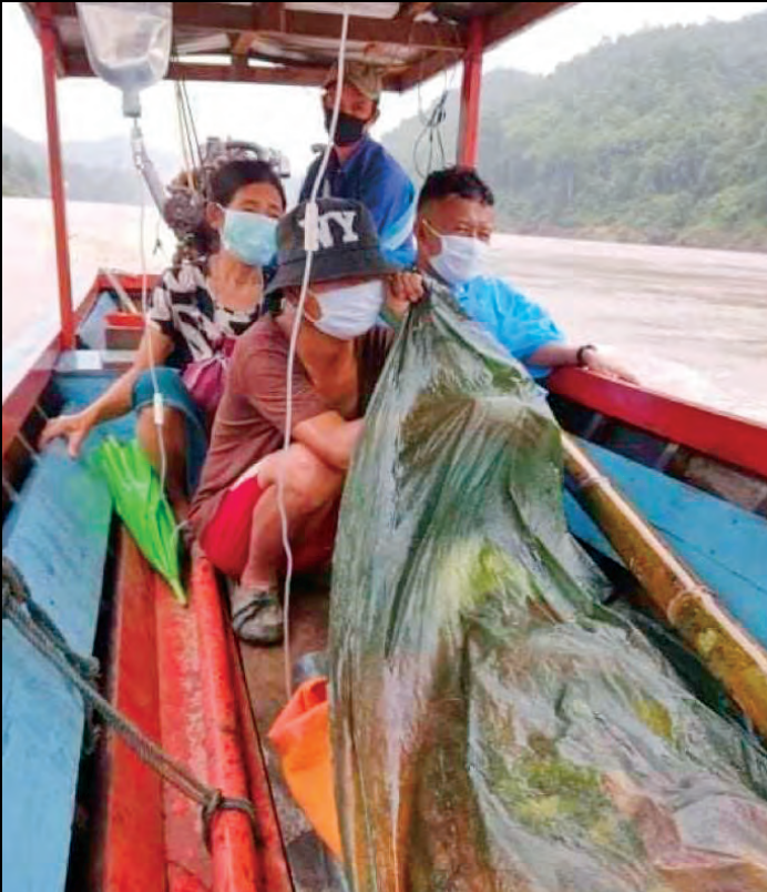
TRANSPORTING THE WOUNDED

country we are working in has many safe areas that the government does not have control over. But they are controlled by different tribes, and the government has a hands-off policy to keep the peace and that we would be able to build homes and not be bothered by corrupt officials or the criminals.