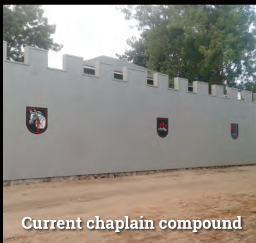
Current chaplain compound

need, even stating he only found one righteous man in a thousand and not a single woman. Such insight demands intentional strategic planning and action! God's people often miss what should be so evident, I do not want to make the same mistake. That's why we are also expanding the church and Sunday school rooms at the current facility. After salvation, discipleship is a critical need for God's people to grow.