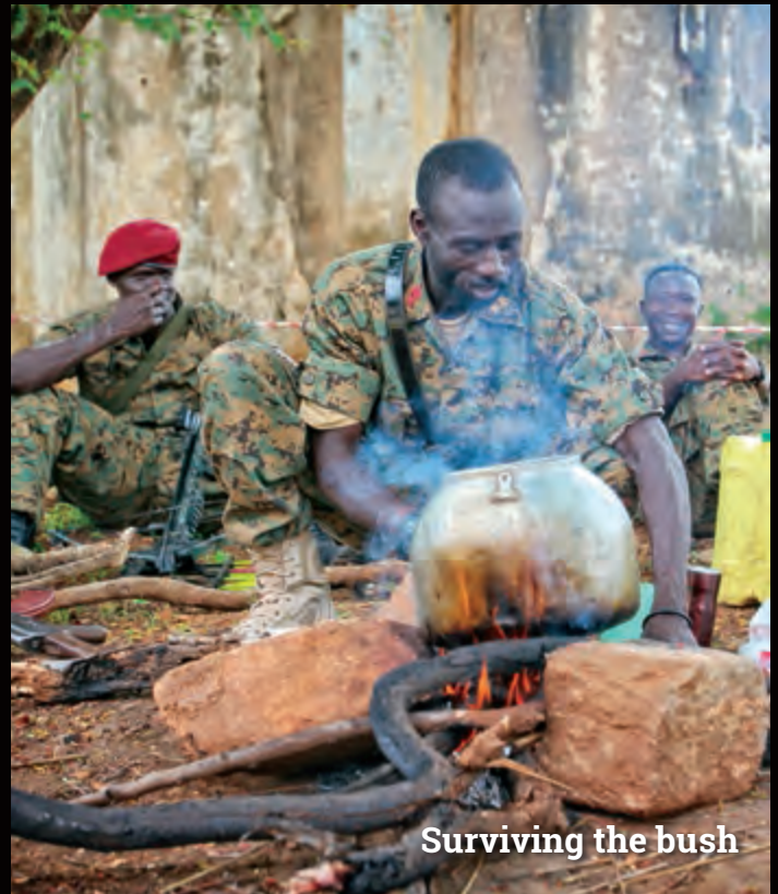
Surviving the bush